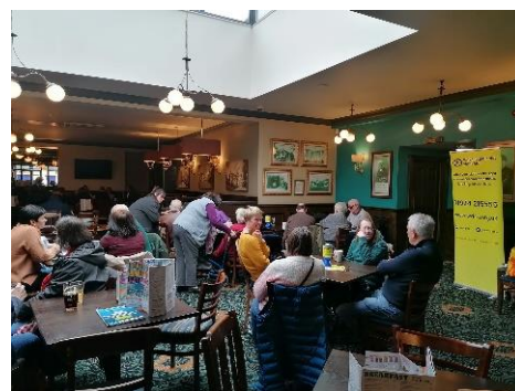
People enjoying our Pontefract coffee morning.

Pontefract coffee morning: 10am – 12 noon on the fourth Thursday of the month (at The Broken Bridge Wetherspoon, 5 Horse Fair, Pontefract, WF8 1PD). Come and join us for a cuppa and a natter. You can find us towards the back of the pub, near the toilets. If you are not familiar with The Broken Bridge, staff will be happy to help you find us. Please note there will be no coffee morning in December as it would fall on Christmas Day!