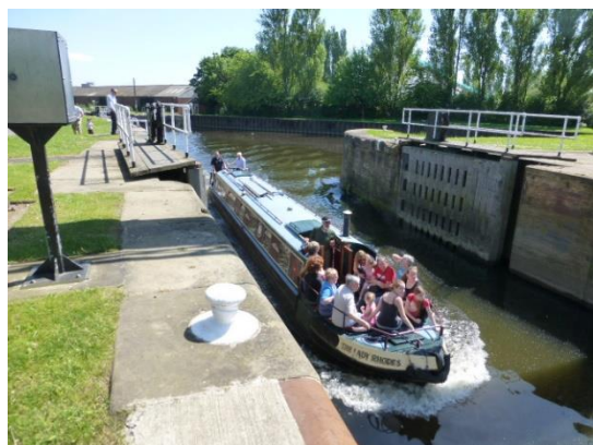
A canal boat at a lock.

Living Well with Sight Loss is a partnership between WDSA and RNIB, made possible with the kind support of Wakefield Council. Access to Lightwaves is step-free. Places are limited, so please contact the office on 01924 215555 and we will be happy to give you further information and book your place.