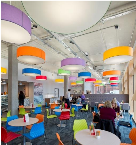
The interior of the Create Café.

We are thrilled to announce that our Christmas lunch this year will be taking place at the Create Café at Wakefield One!