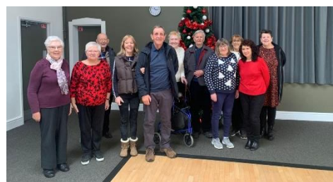
Members of our Horbury group.

Horbury coffee morning: 10am – 12 noon on the second Tuesday of the month (The Cluntergate Centre Café, Cluntergate, Horbury WF4 5DA). Our friendly group of Horbury regulars would love to welcome you to our regular gathering in this vibrant community centre!