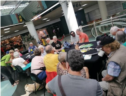
People enjoying our Ridings coffee morning.

All our events up to the end of April 2026 are shown on the calendar on the middle pages (p6-7). Here is a summary of what's coming up: