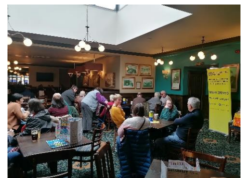
People enjoying our Pontefract coffee morning.

Pontefract coffee morning: 10am – 12 noon on the fourth Thursday of the month (at The Broken Bridge Wetherspoon, 5 Horse Fair, Pontefract, WF8 1PD). Come and join us for a cuppa and a natter. You can find us towards the back of the pub, near the toilets. If you are not familiar with The Broken Bridge, staff will be happy to help you find us.