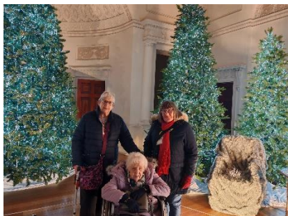
Members at Nostell Priory.

Happy New Year! We hope you have all enjoyed a lovely break over the festive period. It was great to see so many people at our events during December, especially at our panto trip, Christmas lunch and our festive trip to Nostell Priory!