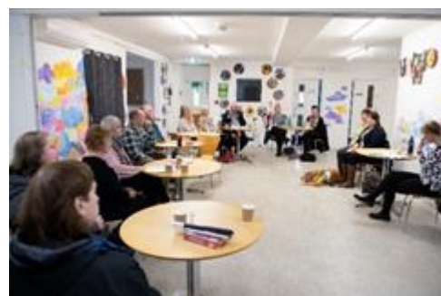
A group of people at a Living Well with Sight Loss course.