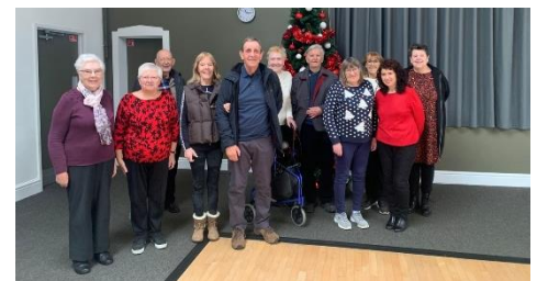
Members of our Horbury group.

Horbury coffee morning: 10am – 12 noon on the second Tuesday of the month (The Cluntergate Centre Café, Cluntergate, Horbury WF4 5DA). Our friendly group of Horbury regulars would love to welcome you to our regular gathering in this vibrant community centre!