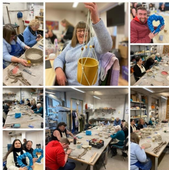
A collage of people making crafts.

We ask for a voluntary contribution of £3 per session per participant. This helps towards the costs of equipment, materials, tuition, room hire, and refreshments (tea, coffee, biscuits).