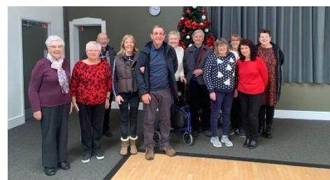
Members of our Horbury group.

Horbury coffee morning 10am – 12 noon on the second Tuesday of the month (The Cluntergate Centre Café, Cluntergate, Horbury WF4 5DA). Our friendly group of Horbury regulars would love to welcome you to our monthly gathering in this vibrant community centre!