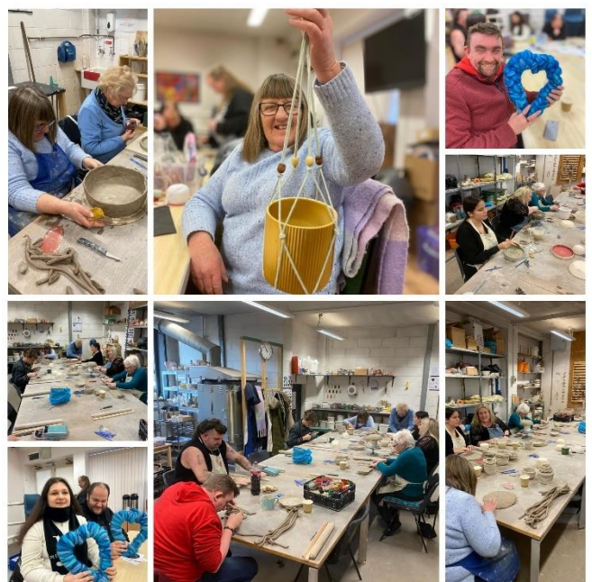
A collage of people making crafts.

We cover a variety of art and craft techniques during our informal and fun sessions. You don’t have to come every week, and all techniques are made fully accessible so you can create pieces to be proud of no matter what your level of sight or previous experience. There is always a choice of techniques on offer, so you will always find something that appeals to you!