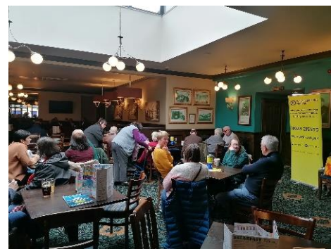
People enjoying our Pontefract coffee morning.