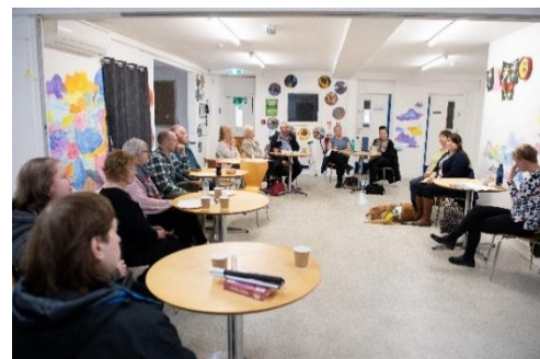
A group of people at a Living Well with Sight Loss course.