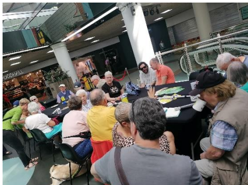
People enjoying our Ridings coffee morning.

All our events up to the end of July 2025 are shown on the calendar on the middle pages (p6 - 7). We've made this bigger to hopefully make it easier to use. Here is a summary of what's coming up: