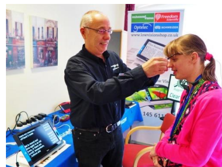
Optelec staff demonstrating wearable technology.

demonstrating the latest assistive technology and will be available for 30-minute individual appointments to enable you to try some of the latest aids and adaptations on the market for blind and partially sighted people.