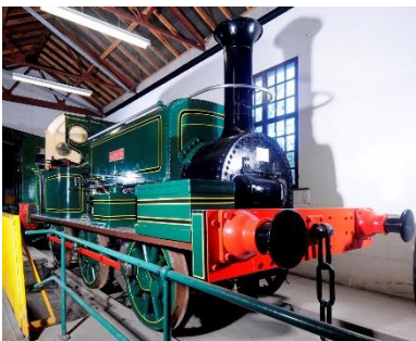
Leeds locomotive Aldwyth, at Leeds Industrial Museum.

We are delighted to invite you to join us on a day out at Leeds Industrial Museum at Armley Mills! The museum is housed in a Grade II listed building which was once the world's largest woollen mill. Built in 1805, the current buildings reopened as a museum of industrial heritage in 1982.